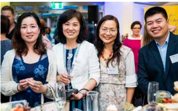
A selection of images from the Welcome to 2019 Cocktails and Ravenswood Anzac Day Service