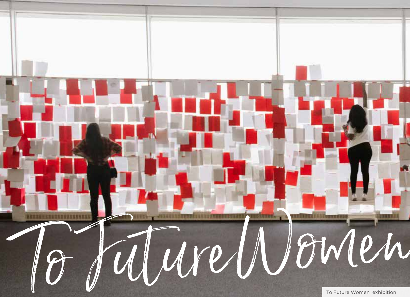
To Future Women exhibition