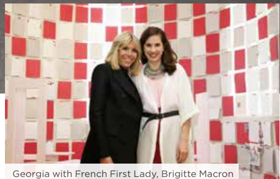
Georgia with French First Lady, Brigitte Macron

interested in how sisterhood works and how women connect with each other. I always felt very empowered at Ravenswood and this is probably a natural extension of that.'